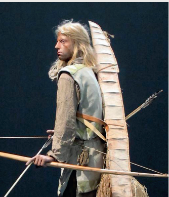
Reconstruction of the owner of the Neolithic bow case.

As early as the 20th century, the discovery of roof tiles on Lake Iffig and a coin near the Wildhorn hut suggested that the pass or at the least the alpine pastures around the lake were used in the Roman Period.